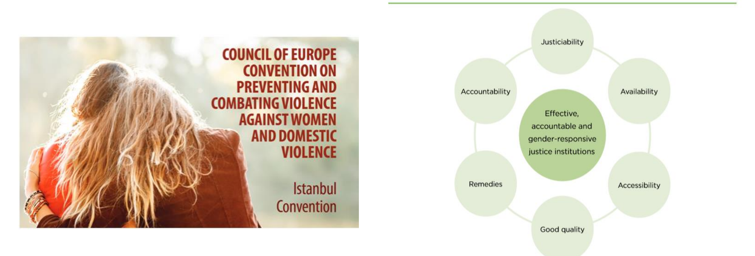
FIGURE 1.7 Six components of effective, accountable and gender-responsive justice institutions